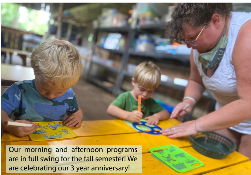
Our morning and afternoon programs are in full swing for the fall semester! We are celebrating our 3 year anniversary!

Any suggestions for future topics are always appreciated!